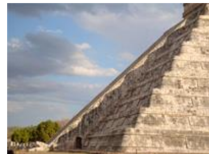
The serpent in Chichen Itza during the equinox